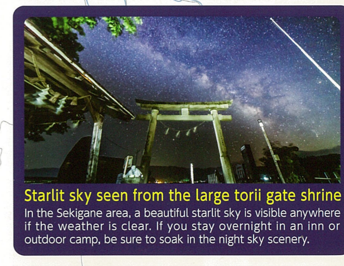
Starlit sky seen from the large torii gate shrine In the Sekigane area, a beautiful starlit sky is visible anywhere if the weather is clear. If you stay overnight in an inn or outdoor camp, be sure to soak in the night sky scenery.